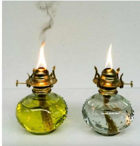
Figure 4. A visual demonstration comparing the combustion of conventional diesel (left) and air-to-fuels™ liquid (right).