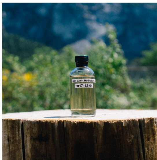
Figure 3. Air-to-fuel™ product.

be an interesting partnership proposition for the Canadian based CE or other DAC firms; they could provide a technologically based solution to facilitate the first transition to carbon-neutrality for an entire jurisdiction.