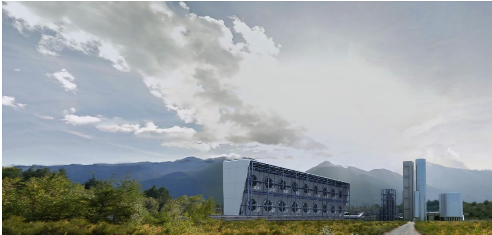
Figure 1. Artists' impression of CE Direct Air Capture and Air to Fuels™ plant, which will capture 1 MT of CO 2 per year.

2.5. Other DAC developments have been commercially scaled by firms such as Climeworks in Switzerland and Global Thermostat in Alabama. Climeworks use a design with low energy requirements, using residual heat from a local waste incineration plant. Their development, which was the first industrial scale DAC facility, began operation in 2017 in Zurich and is capable of capturing 900t (0.0009 Mt) per year, at a cost of $600 per tonne. The CO 2 is used to increase vegetable yields in a nearby greenhouse (Tollefson, 2018). Global Thermostat, by comparison, has operations that remove up to 50,000 t (0.05 Mt) for $120 per tonne and has recently partnered with ExxonMobil with the intention to produce DAC-to-fuel technology.