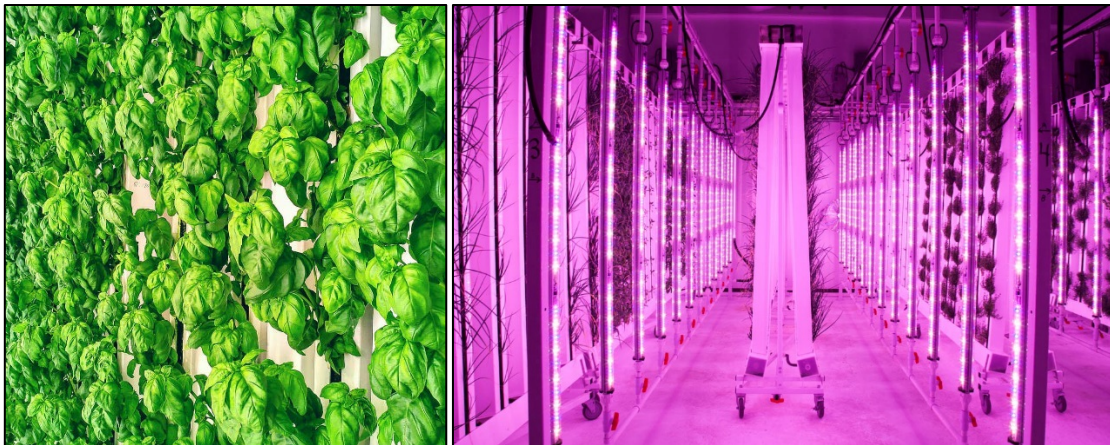
Figure 2. Sweet Basil ( Ocimum basilicum ) growing on a vertical-plane ZipGrow system (left). Zipfarm (daytime) (right).