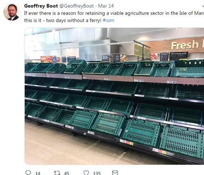
Figure 1. Geoffrey Boot, MHK (Minister for DEFA) showing the impacts of supply disruption to Isle of Man fresh produce,